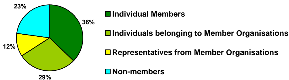
Figure 1: Types of complete response to the survey

For the analysis of the survey, only data from complete responses was used. Figure 1 shows the types of responses from which the data was collected. To find out more about ALT members go to: http://www.alt.ac.uk/membership_join.html .