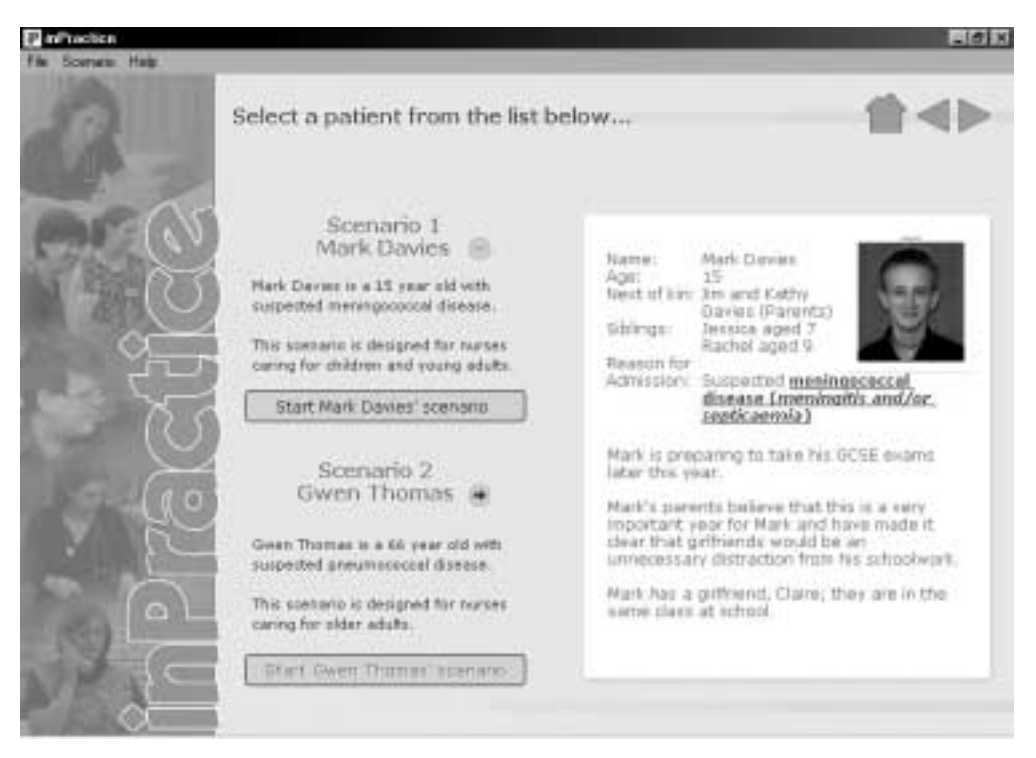
Figure 1. A typical introductory screen in an inPractice scenario