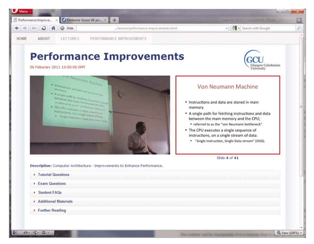
Figure 2. Screenshot of the prototype showing the general interface.

The full navigation structure of the prototype is based around themes rather than around individual lectures. For example one theme is the generation of 3D graphics. This unit consists of a number of captured videos and slides (one set per lecture) merged into a single "presentation". As with traditional lecture capture, this content can be navigated linearly through the lectures. The other elements of the theme provide for other forms of navigation and interaction.